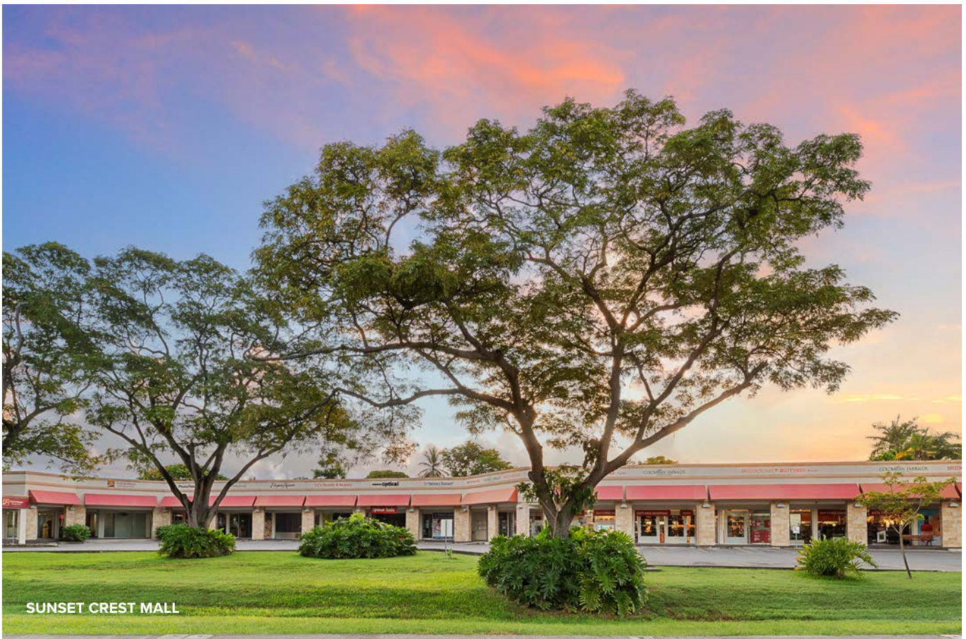
SUNSET CREST MALL