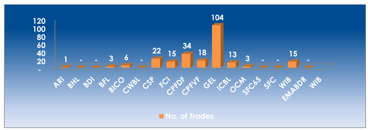
Figure 1 – No. of Trades – 1st Quarter 2020

Table 3 and Table 4 illustrates the top traded securities for the quarter based on volume and value respectively. Goddard Enterprises Limited was the top performer in terms of both volumes and values traded during the first quarter of 2020. Eppley Caribbean Property Fund SCC – Development Fund and Eppley Caribbean Property Fund SCC – Value Fund rounded out the top three securities in terms of volume traded while Cave Shepherd and Company Limited and West India Biscuit Company Limited rounded out the top three in terms of value traded.